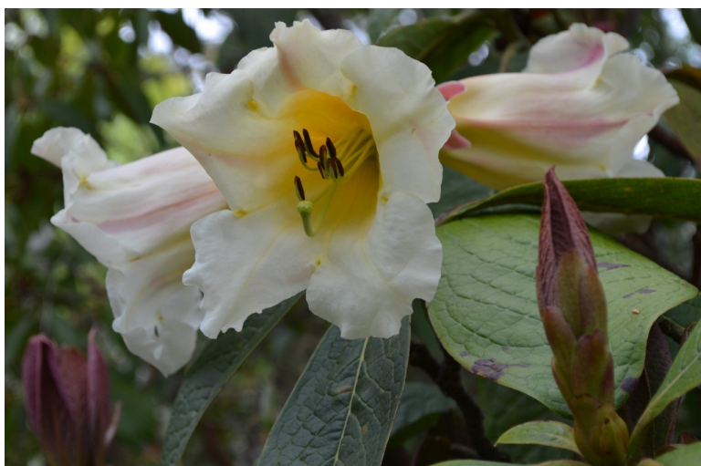
Rhododendron sinonuttalii Tannock Glen, 21 October 2014